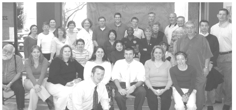
The staff of Valley Catholic are here to help you succeed.

There are so many people at Valley Catholic that can help you, many more than could be fit into this newspaper. Perhaps the most important people will be people from your own class, people who have gone to Valley Catholic for several years. Remember to always communicate your questions, clearly with your peers or teachers. They will be more than happy to help you out.